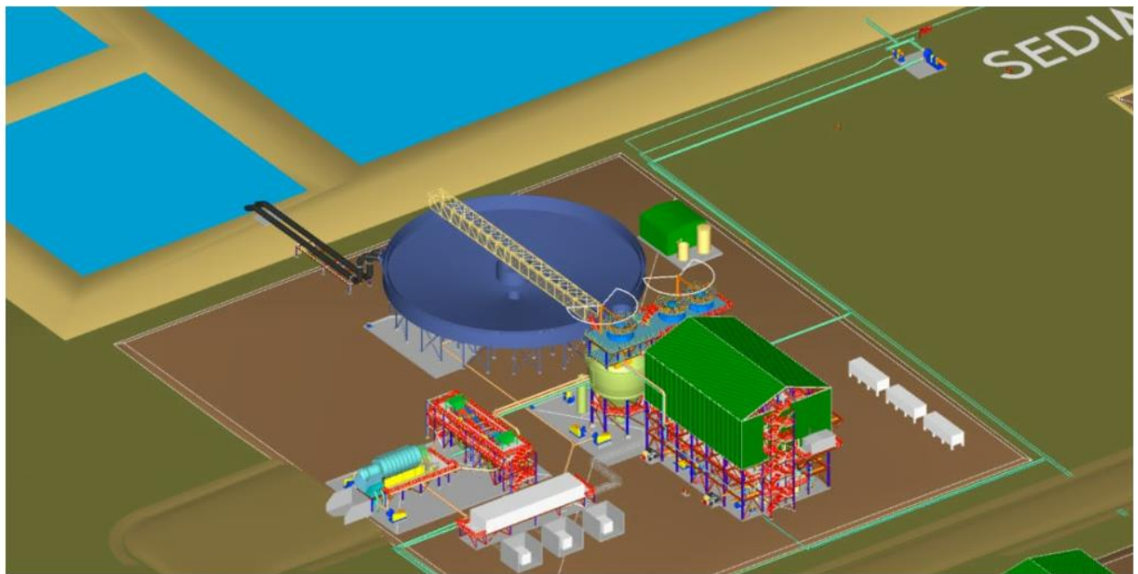
Figure 1. Donald Project 3D design of wet concentrator plant (WCP) layout.

production utilisation levels of key parts of the process. Project flowsheets and design concepts were evaluated to identify areas where efficiencies could be made, for example in product handling and logistics functionality. Attention was also focussed upon the means to reduce off-stream production time through various means including product diversion points and by stockpiling feed for downstream circuits in the event of unforeseen outages or during scheduled maintenance programmes. These flowsheet and design enhancement considerations have been deliberately built into the design stage before moving to the full of DFS design phase.