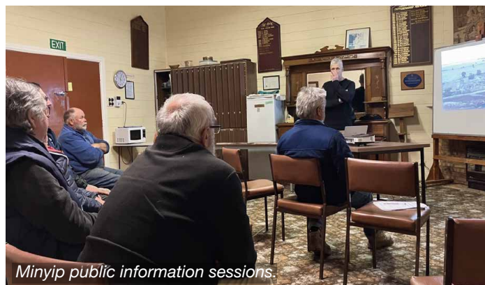
Minyip public information sessions.