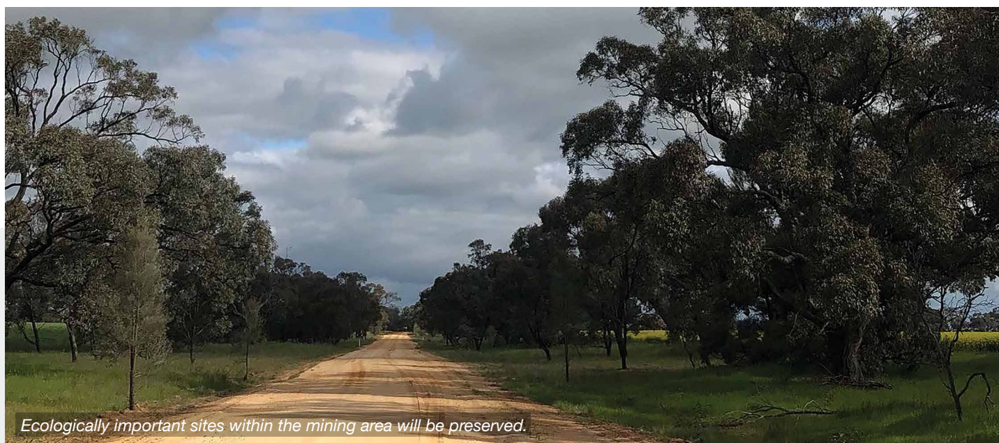
Ecologically important sites within the mining area will be preserved.