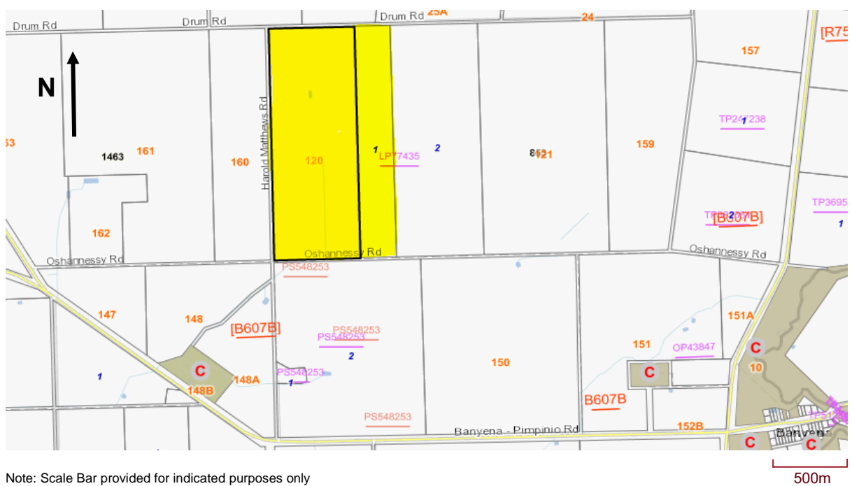
Figure 3. Bulk Test Pit - Costean location

Note: Scale Bar provided for indicated purposes only