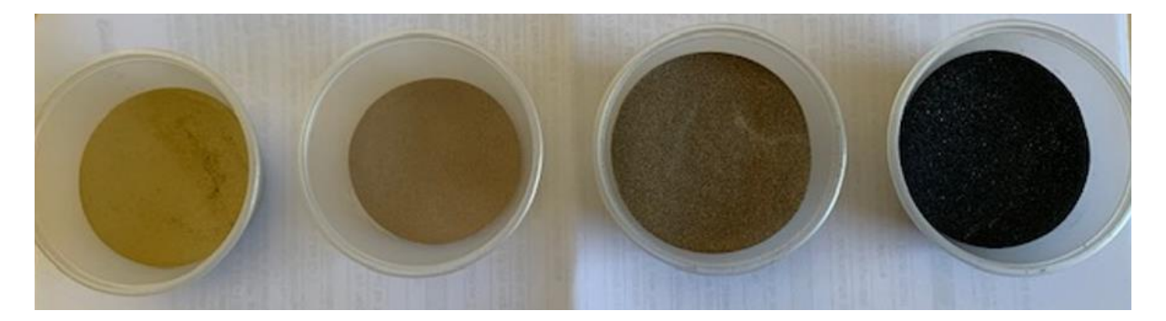
Figure 1. Astron's final product samples (REEC, zircon, non-magnetic concentrate, magnetic concentrate respectively)